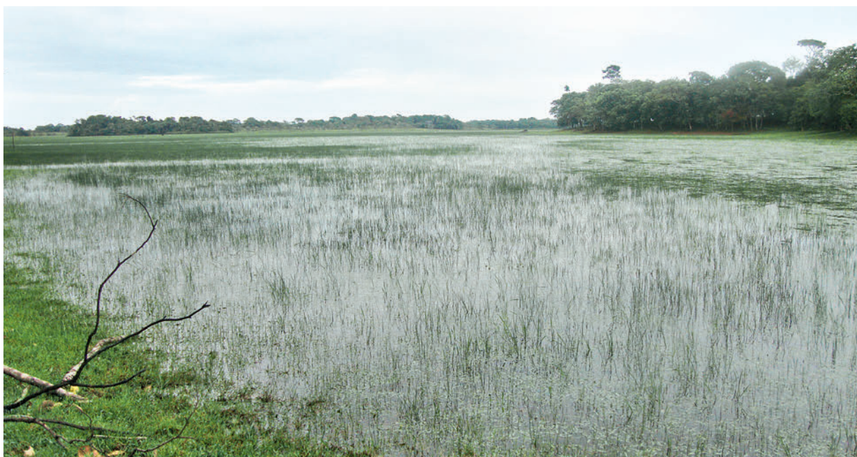
Fig. 5. Photograph of the collecting site of the holotype.

prevailed (see Fig. 5). This flooded grassland appears only during the rainy season, from January to June, as a consequence of river overflows. The annual air mean temperature is 28 °C (PEREIRA et al. , 2002). In the same biotope, we found Rivulus schuncki COSTA & DE LUCA, 2011, juveniles of Hoplerythrinus unitaeniatus (SPIX & AGASSIZ, 1829) and Nannostomus sp.