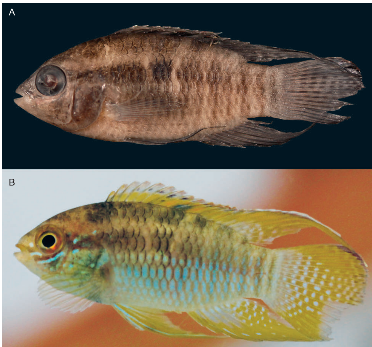
Fig. 1. Laetacara flamannellus sp.n.: A, UFRJ 8060, 34.0 mm SL (holotype); and B, paratype collected with the holotype.