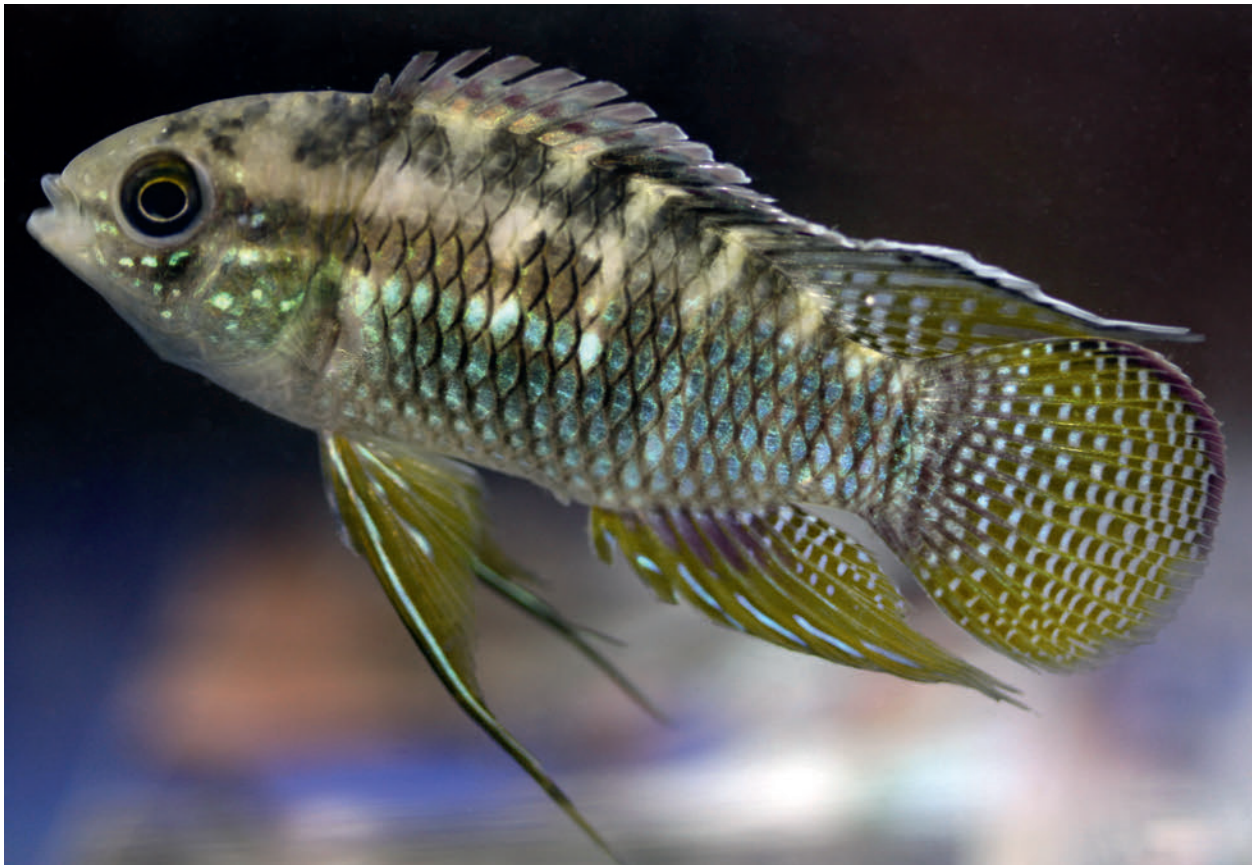
Fig. 2. Laetacara curviceps : Lago Utinga, Belém municipality, Pará state.

fin, in some specimens surpassing posterior margin of caudal fin. Caudal fin rounded. Pectoral fin rounded. Pectoral-fin base on vertical through dorsal-fin origin. Tip of pectoral-fin reaching vertical through vertical trunk bar 4. Pelvic fin pointed. Pelvic-fin base on vertical through second or third spine of dorsal fin. Tip of pelvic fin approximately reaching vertical through second anal-fin ray.