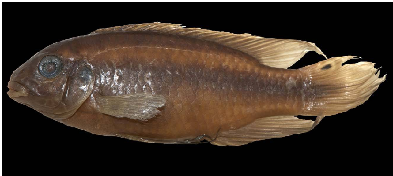
FIGURE 1. Neotype of Pelvicachromis sacrimontis , MRAC 86-10-P-102, male, 66.4 mm SL, Nigeria: Chokoche, Imo River, Rivers State, Niger River system, 4° 59' N, 7° 59' E, Collected by P.J. Akiri, August 1985.

Diagnosis. A species of Pelvicachromis , distinguished from all congeners by a combination of characters as follows: Differs from Pelvicachromis taeniatus (Boulenger, 1901) and Pelvicachromis subocellatus (Guenther, 1871) in absence of a pattern of pale blue and reddish dots on the caudal fin of adult males. Differs from Pelvicachromis roloffii (Thys van den Audenaerde, 1968) in a broader midlateral band on the body, absence of small dots in the male caudal fin, absence of red margin with whitish to bluish submargin in the female dorsal fin. Differs from Pelvicachromis humilis (Boulenger, 1916), Pelvicachromis rubrolabiatus Lamboj, 2004 and Pelvicachromis signatus Lamboj, 2004 in absence of dark vertical bars on body. Differs from Pelvicachromis pulcher in a broader midlateral band on the body, usually as broad or broader than a pale yellowish band dorsal to this dark band, iridescent blueish to turquoise coloration band on cheeks and a different coloration of the dorsal fin in females (no margin, spiny portion pale to dark and dusky orange, soft parts yellowish to clear in most posterior regions vs. black margin, yellow submargin and black fin base in P. pulcher ).