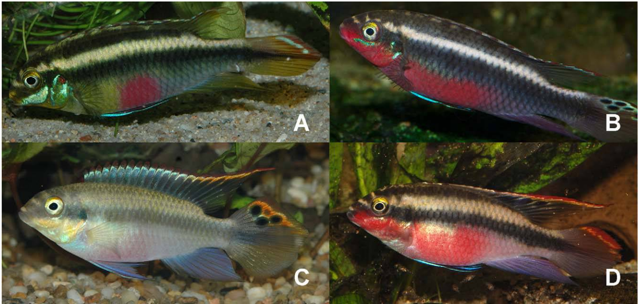
FIGURE 2. Comparison of coloration of males of P. sacrimontis and P. pulcher ; A. male of P. sacrimontis in aquarium, Nigeria, Rivers State, yellow morph, SL 53 mm, not preserved; B. male of P. sacrimontis in aquarium, Nigeria, Rivers state, red morph, SL 67 mm, not preserved; C. male of P. pulcher , selected from a commercial import from Nigeria, not measured, not preserved; D. male of P. pulcher , F2 of commercially imported specimens from Nigeria, not measured, not preserved.