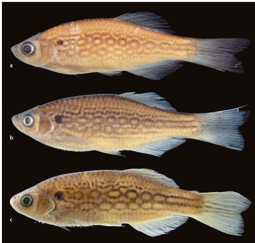
Fig. 3. a, Danio catenatus , NRM 45661, holotype, 45.4 mm SL; Myanmar: Rakhine State: Kananmae Chaung; b, Danio concatenatus , BMNH 2011.3.24:50, holotype, 61.1 mm SL; Myanmar: Rakhine State: Comepyo Chaung near Gwa; c, Danio sypshigmatus , NRM 65561, holotype, 63.3 mm SL; Myanmar: Mon State: Ale village at Malwe Mountain.

trally 5(1), 6*(4), 7(3), (1). Dorsal fin inserted at highest point of dorsum, slightly posterior to half distance from snout tip to caudal-fin base, and slightly anterior to vertical from anal-fin origin. Pectoral-fin insertion at about vertical through posterior margin of opercle; branched rays forming straight or slightly rounded margin, leading unbranched ray slightly prolonged beyond rest of fin, reaching slightly beyond insertion of unbranched pelvic-fin ray. Tubercles absent from pectoral fin. Pectoral-fin axial lobe well developed.