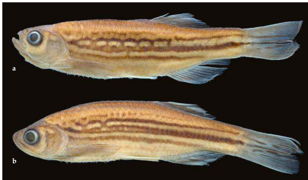
Fig. 4. Danio meghalayensis , UMMZ 243666; India: Khasi Hills: Umshing River; a, 50.5 mm SL; b, 46.5 mm SL.

barbel not reaching beyond pectoral-fin base (vs. much longer), absence or multiple rows of round or slightly elongate rings on side (vs. presence), branched anal-fin rays 10\frac{1}{2} – 12\frac{1}{2} (vs. 13\frac{1}{2} – 16\frac{1}{2} ); from all except D. feegradei by branched anal-fin count branched dorsal-fin rays 8\frac{1}{2} (vs. 9\frac{1}{2} – 10\frac{1}{2} ); different from D. feegradei in presence of horizontal stripes along side, P, P+1 and P-1 stripes distinct, occasionally P and P+1 stripes anastomosing (vs. absence).