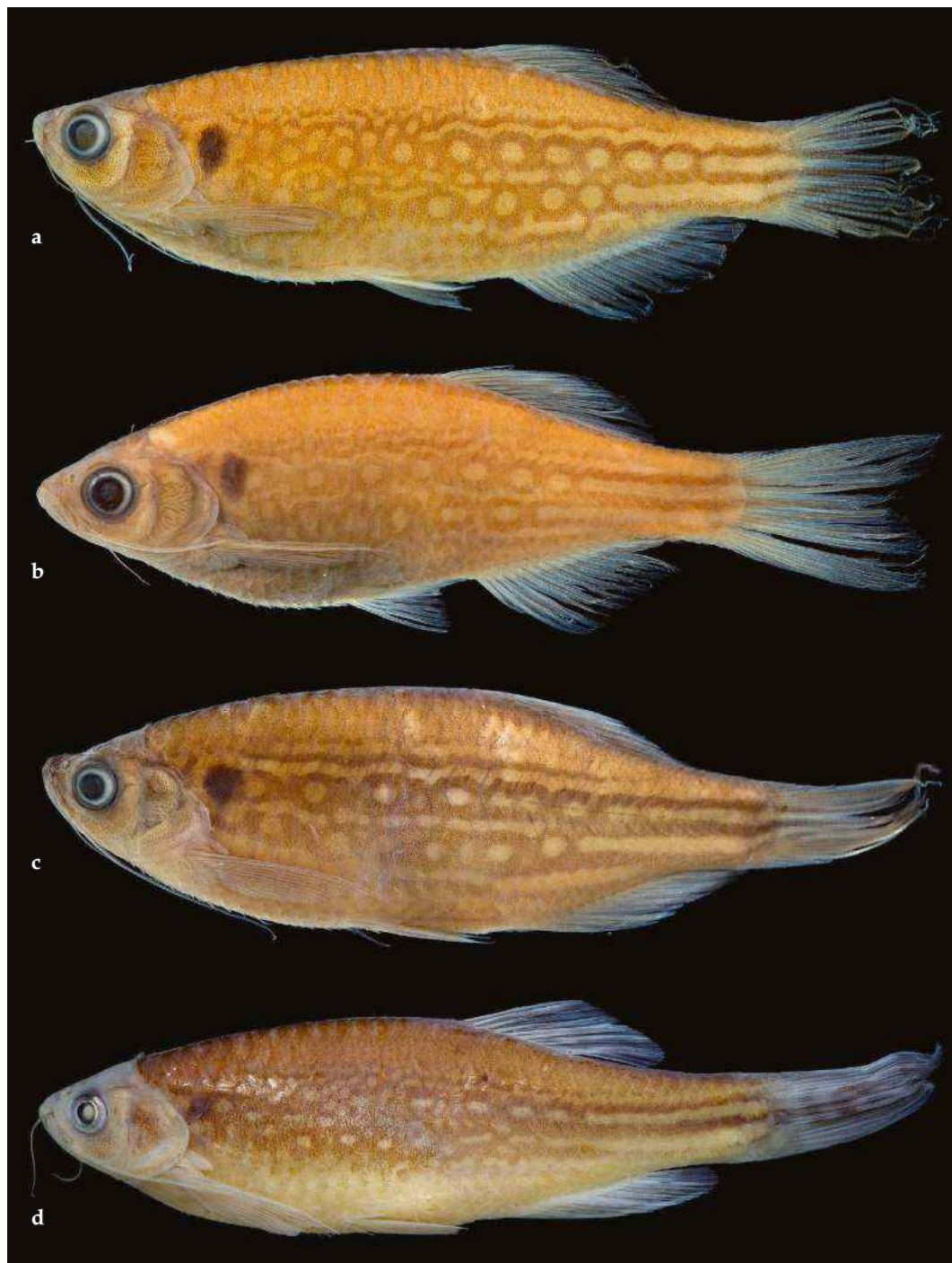
Fig. 1. a , Danio dangila , UMMZ 243658, 48.3 mm SL; India: Ganga River drainage: Ambari; b , Danio dangila , CAS 50240, 43.2 mm SL; Nepal: Ganga River drainage: Rapti River; c , Danio assamila , NRM 65571, holotype, 55.0 mm SL; India: Assam: Brahmaputra River drainage: Amguri; d , Danio assamila , NRM 51441, paratype, 57.3 mm SL; India: Assam: Brahmaputra River drainage: Nagaon, Lanka forest.