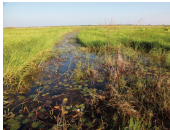
Figure 2. Habitat of T. somphongsi in a deepwater rice field, flood plains of Bangpakong Basin, central Thailand.