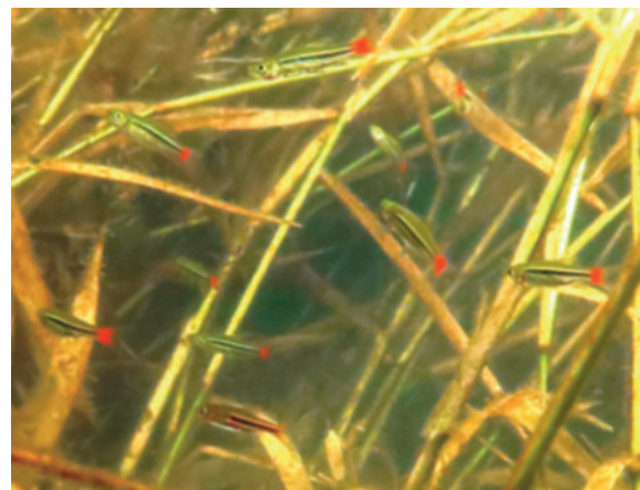
Figure 3. Trigonostigma somphongsi in its natural habitat can be found in mixed school with many other small cyprinids.